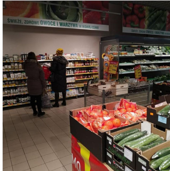
FIGURE 1 Examples of photographs of policies targeting physical activity (PA) and healthy nutrition - captions and coding. Top left panel: a lack of policy solution (female, 16 years old, a rural - low SES area; coded as V5 and I6 from MOVING). Caption: This photograph presents a lack of safe infrastructure to get, for example, to/from school; a cycling path should be created between our village and the town (i.e., where the school is). Top right panel: a lack of policy solution (female, 16 years old, a rural - low SES area; coded as O7 from NOURISHING). Caption: This photograph pictures a vending machine at the community sports center; unhealthy food products should not be available so easily, especially in places promoting physical activity. Bottom left panel: a presence of policy solution (female, 16 years old, a rural - low SES area; coded as V2 and V6 from MOVING). Caption: This photograph presents a public outdoor gym next to the school and a sports field, which provide an easy and cost-free opportunity for all the residents to be active. Bottom right panel: a presence of policy solution (female, 17 years old, a rural-urban - low SES area; coded as Nfe4 from NOURISHING). Caption: This photograph shows a section with healthy and affordable food options available in stores because of product positioning regulations (the sign says: fresh, healthy fruits and vegetables at a low price). Makes it easier for people to shop because most of the healthy products are located in one place, so they do not have to look all over the store, and they can be sure that these products are healthy. This is helpful, especially for those who do not recognize products with healthy ingredients.