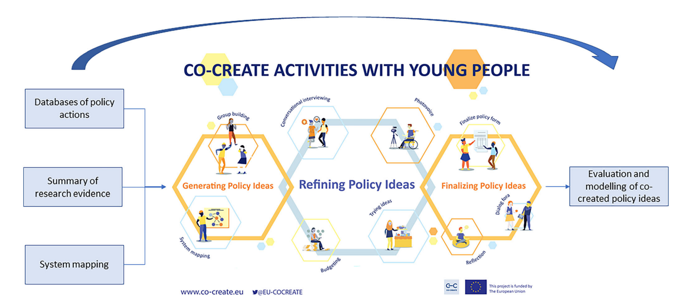
FIGURE 2 The overall flow of the CO-CREATE project and the relation between the two main objectives: Monitoring and youth engagement process

Ensuring that the novel aspects and findings of the CO-CREATE project are disseminated widely has been a key consideration