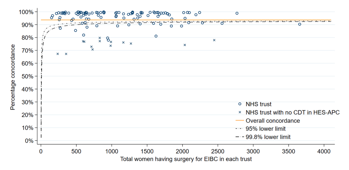
Fig. 2. Funnel plot showing the percentage concordance between SACT and HES-APC, among women receiving surgery for early invasive breast cancer, by diagnosing NHS trust. Key: CDT = Cancer Drug Therapy; SACT = Systemic Anti-Cancer Therapy data; HES-APC = Hospital Episodes Statistics Admitted Patient Care data.