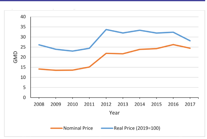
Figure 1 Average real price, 2008–2017.

The pseudolongitudinal data are then merged with the national-level cigarette price, which allows us to investigate the relationship between price and smoking experimentation. The price data were obtained from The Gambia Bureau of Statistics. The price trend is shown in figure 1.