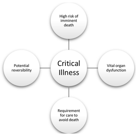
Figure 2 The defining attributes of critical illness.

There are an estimated 30–45 million cases of critical illness globally each year.<sup>2</sup> Many patients are cared for in hospitals with illnesses that are causing vital organ dysfunction and that are imminently life-threatening. There is much work done to identify patients with critical illness such as the use of single severely deranged vital signs,<sup>17</sup> or compound scoring systems such as the National Early Warning Score and The Sequential Organ Failure Assessment score.<sup>18 19</sup> In hospitals, the severity of patients' conditions can be assessed using tools such as the Acute Physiology and Chronic Health Evaluation<sup>20</sup> and the Simplified Acute Physiology Score.<sup>21</sup>