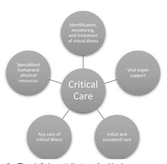
Figure 3 The defining attributes of critical care.

Many hospitals have wards or units for the provision of critical care, such as emergency units, high dependency units or ICUs.<sup>22</sup> Critical care can also be provided in general wards, and a recent global consensus specified the care that should be included for all patients with critical illness in any hospital location.<sup>23</sup> Rapid Response Teams