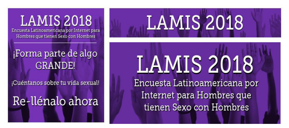
Fig 1. Examples of banners for the promotion of the LAMIS-18 survey.

https://doi.org/10.1371/journal.pone.0277518.g001