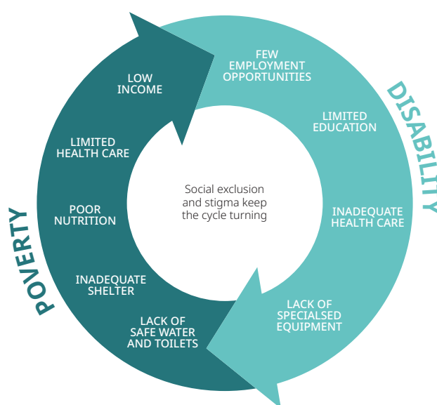
Figure 1. The vicious cycle between poverty and disability (4)

People with disabilities have lower educational attainment than children without disabilities (5), and adults with disabilities are 50% more likely to be unemployed (1). Even though people with disabilities have greater healthcare and rehabilitation needs, they are 50% less able to afford it than non-disabled people and are 50% more likely to experience catastrophic healthcare costs, which pushes them further into poverty (6, 7).