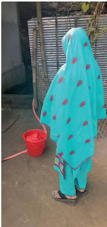
Figure 5. Water quantity