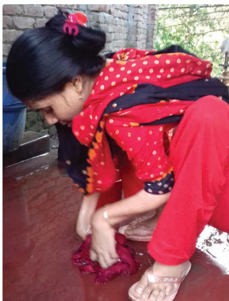
Figure 9. Inaccessible laundry area

“The washing area is too narrow, which is out of my comfort. I need a high place where I can wash my own clothes like other members of my family.”