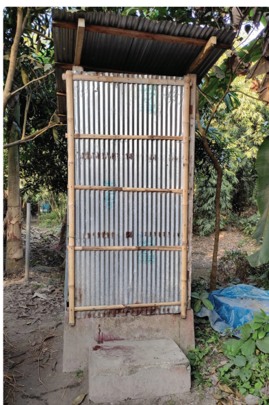
Figure 8. Safety and security

“Our toilet is not suitable for a person like me. It does not have any features for the physically challenged person.”