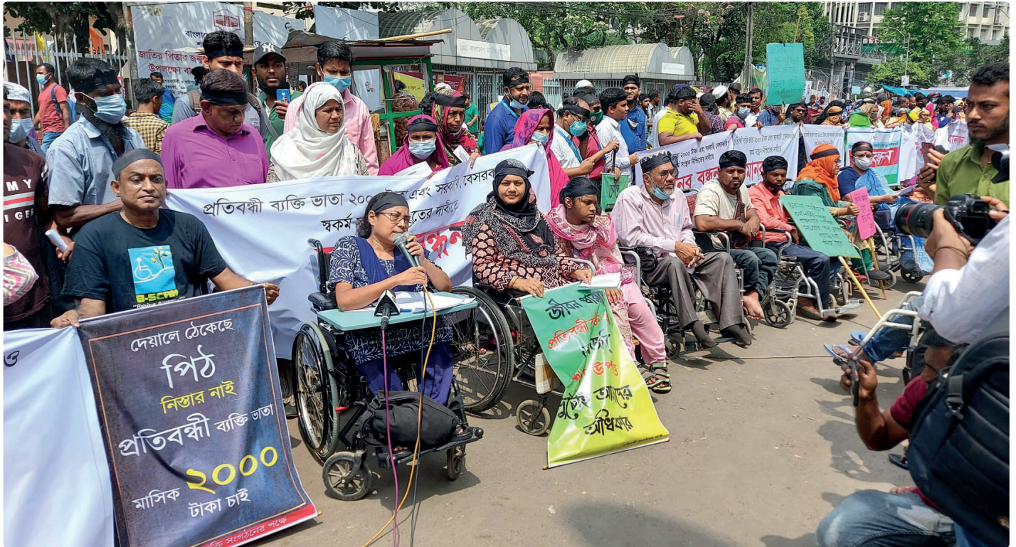
Figure 11. Human Chain formed to demand disability rights