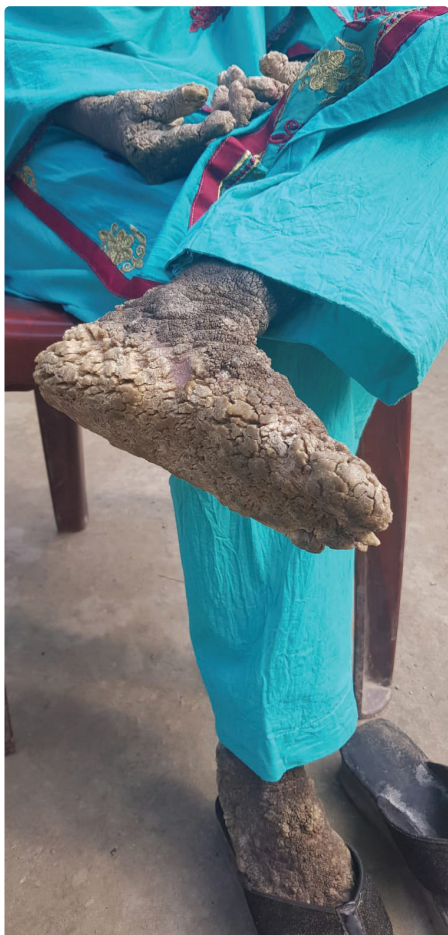
Figure 4. Disability discrimination