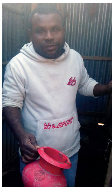
Figure 7. Inaccessible latrine

“Because we have a squat toilet with no facilities for water supply, I require assistance while using it. When no one is around, I try to find the footplates on the toilet pan with my hands before placing my feet on them to prevent any unwanted mishaps.”