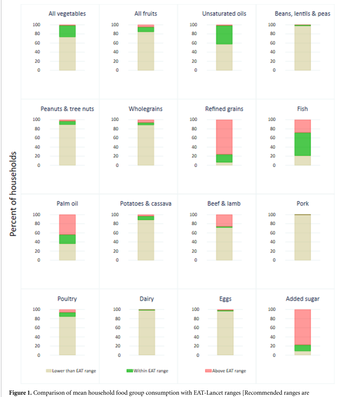
Figure 1. Comparison of mean nousehold food group consumption with EA1-Lancet ranges [Recommended ranges as according to Method 1 with minimum values as described in the 'intake range' column of table 1].

[38], the diet does not fulfil nutritional requirements but consumption is often within recommended levels for food components known to impact heavily on the environment (such as livestock products) [21]. We also identified important socioeconomic characteristics that could serve as leverage points for improving healthiness whilst not impacting on the sustainability of diets in The Gambia.