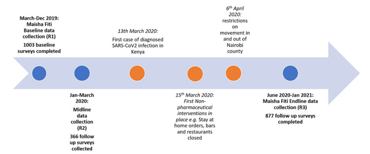
Fig. 1. Timeline of baseline and follow-up surveys in relation to COVID-19 and prevention measures in Kenya.

police arrest, harmful alcohol and substance use, violence from clients and intimate partners and a high prevalence of HIV and other sexually transmitted infections (STIs) (Shannon et al., 2015; Platt et al., 2018). These overlapping risk factors which often perpetuate each other are known as syndemic factors (Singer and Clair, 2003; Buttram et al., 2014). A recent systematic review and meta-analysis examining mental health problems among FSWs in LMICs found high levels of mental health problems including depression, anxiety and PTSD, compared to the general population (Beattie et al., 2020). The authors found strong evidence of associations between depression and recent violence experience (OR 2.3; 95% CI 1.3-4.2), alcohol use (OR 2.1; 95% CI 1.4-3.2), inconsistent condom use with clients (OR 1.6; 95% CI 1.2-2.1) and HIV (OR 1.4; 95% CI 1.1-1.8) (Beattie et al., 2020) as well as associations between recent suicide attempt with ever experiencing violence (OR 3.5; 95% CI 2.2-5.5), alcohol use (OR 1.6; 1.0-2.5) and HIV (OR 1.4; 95% CI 1.1-1.8).