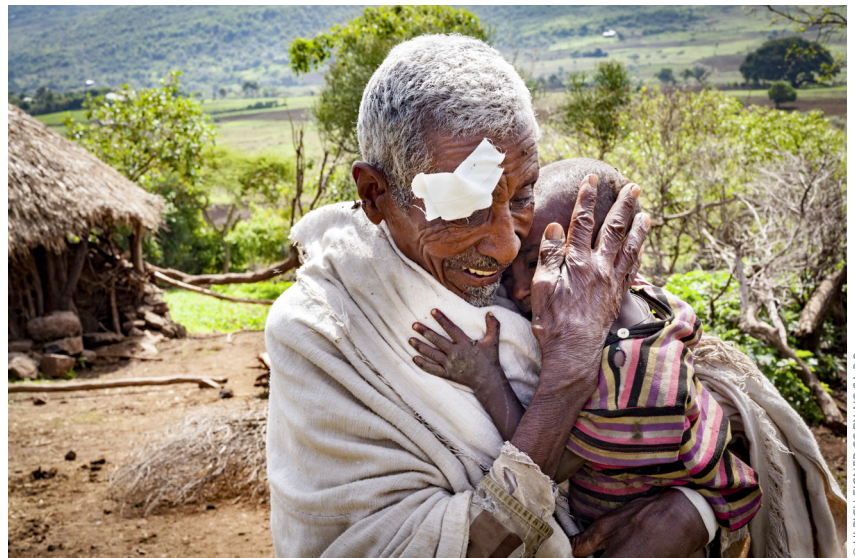
Primary eye health care has the potential to make sight-restoring surgery available to people in the remotest of communities. BURKINA FASO

Primary eye health care – just like primary health care – must include not only the provision of health care services, but also supportive multisectoral policies and action, and the empowerment of community members to take care of their eyes.