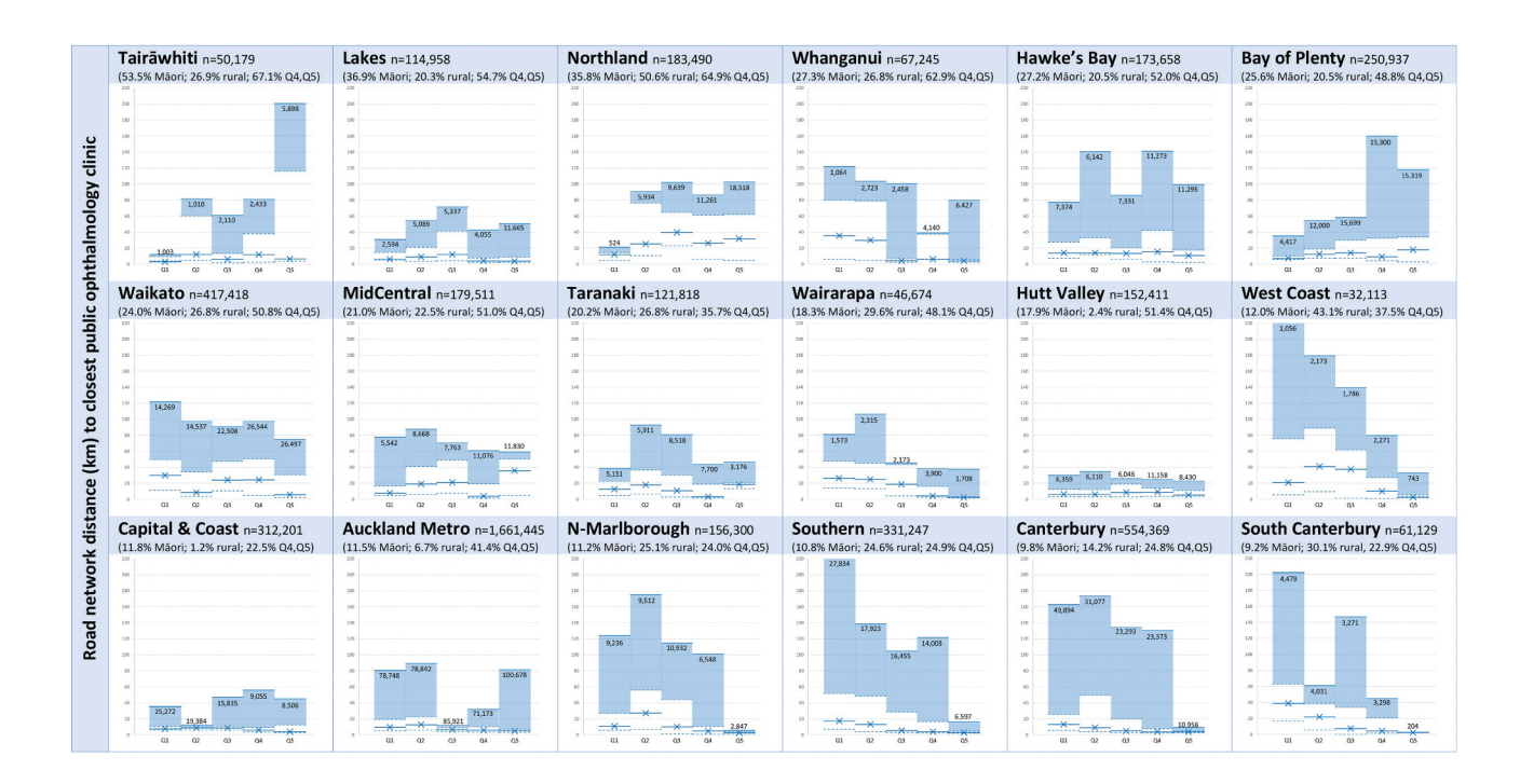
Figure 3. Road network distance (km) from population-weighted centroid of 2018 meshblocks to closest public ophthalmology clinic by District Health Board (DHB) and Area Level Index of Multiple Deprivation quintile (Q1 least deprived/q5 most deprived). Median indicated by X; inter-quartile (IQR) range shown by dashed line; DHBs are arranged from the highest to lowest proportion of the population who identify as Māori; DHB population (n), proportion rural and proportion in Q4,Q5 from Statistics New Zealand's Integrated Data Infrastructure; Proportion of DHB population Māori from Ministry of Health; Shaded area is the quartile with the largest travel distance in each deprivation quintile (from IQR 3 to maximum distance); the number is the size of the population in the quartile furthest away. Auckland Metro consists of Auckland, Waitematā and Counties Manukau DHBs; N-Marlborough = Nelson-Marlborough.

A gradient in distance to optometry can be seen in half of the DHBs, with travel distance tending to increase in a stepwise manner with increasing or decreasing area-level