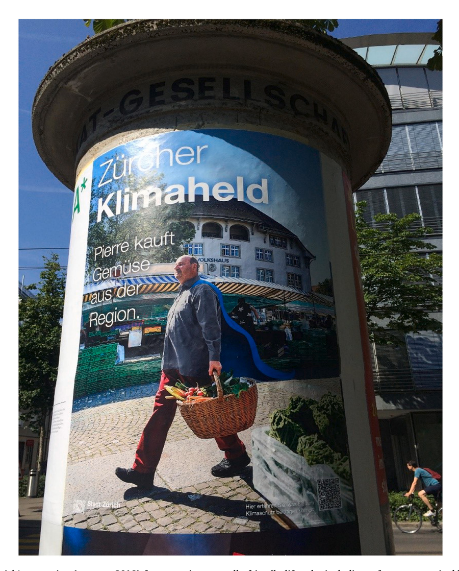
Fig. 2. Advertisement of Zürich's campaign (summer 2019) for an environmentally friendly lifestyle, including a focus on sustainable products sold. Translation: "Zürich climate hero. Pierre buys vegetables from the region"

Yet, as Born and Purcell (2006) critically insist, we should not take such local representations at face value, but rather approach them as particular goals that depend on the agendas of those empowered by a scalar strategy that can have a range of outcomes, both good and bad. With reference to the latter, Watson and Wells (2005) have shown how the conflation of locality with community in the Poppy Street Market in London produces nostalgic narratives and collective memories that mask the very real relations on which 'local' markets are based. Upon closer inspection, it indeed turns out that markets might seem local and durable to the people who advertise and experience them, but that such