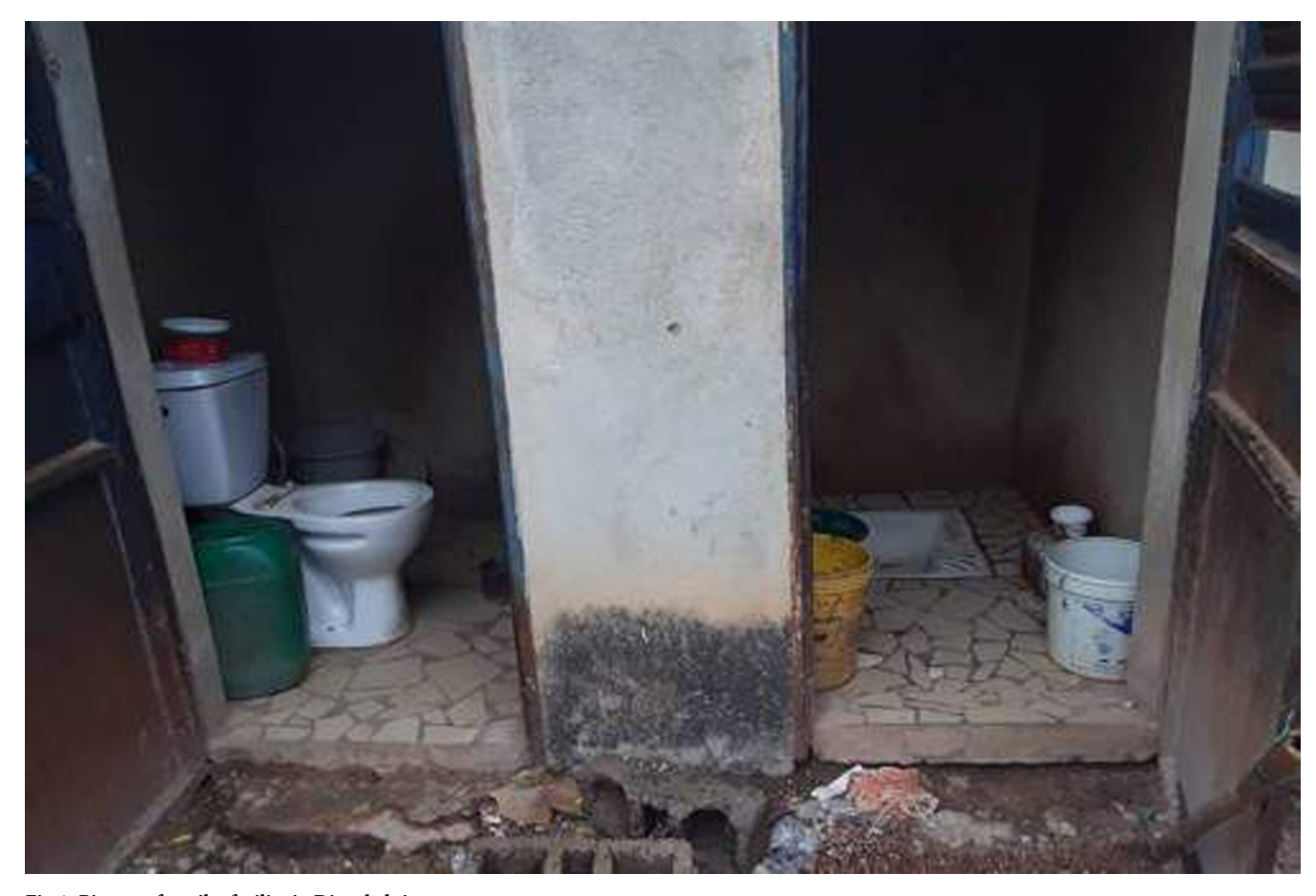
Fig 4. Picture of a toilet facility in Diourbel site. https://doi.org/10.1371/journal.pgph.0000525.g004

Most of the 'dahras' visited had modern toilets built with Turkish chairs, cement walls, a zinc roof and a septic tank as stool disposal system. Some 'dahras' had several toilets, shower toilets and stool toilets (Fig 4). In a few 'dahras', separate toilets were built for the Koranic teachers and the talibés. Traditional toilets built by digging pits with a seat made from cement, a straw fence and no evacuation system were also found in some 'dahras' located in the remote/bushy areas of Diourbel. These were similar to toilet facilities found in all households visited in Saraya villages. When these pit latrines were filled with stools, they were covered with sands and other pits were dug to serve as new toilets (Fig 5). In some households in Saraya, there were no toilets. In these cases, members of the households used neighbours' toilets or practised open defaecation.