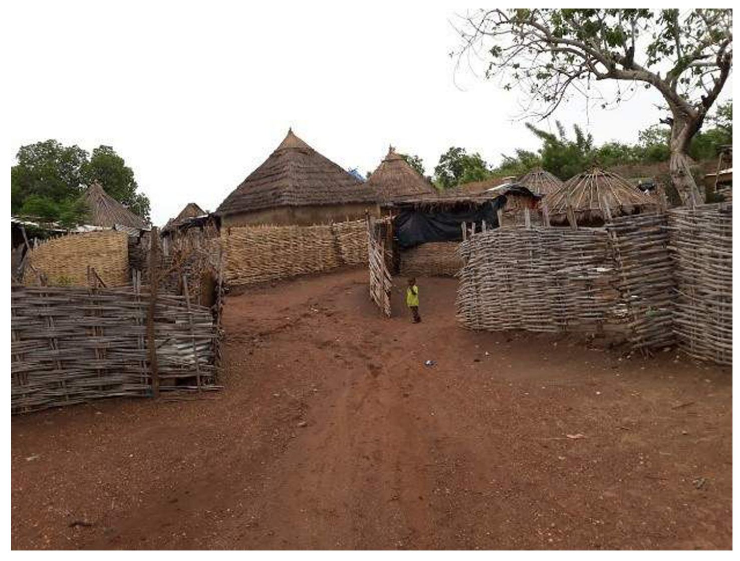
Fig 3. Picture of a household in Saraya site. https://doi.org/10.1371/journal.pgph.0000525.g003

All 'dahra' leaders and Koranic teachers reminded us of the sacred dimension of hygiene in the Islamic religion. The ablutions performed by muslims by washing different parts of the