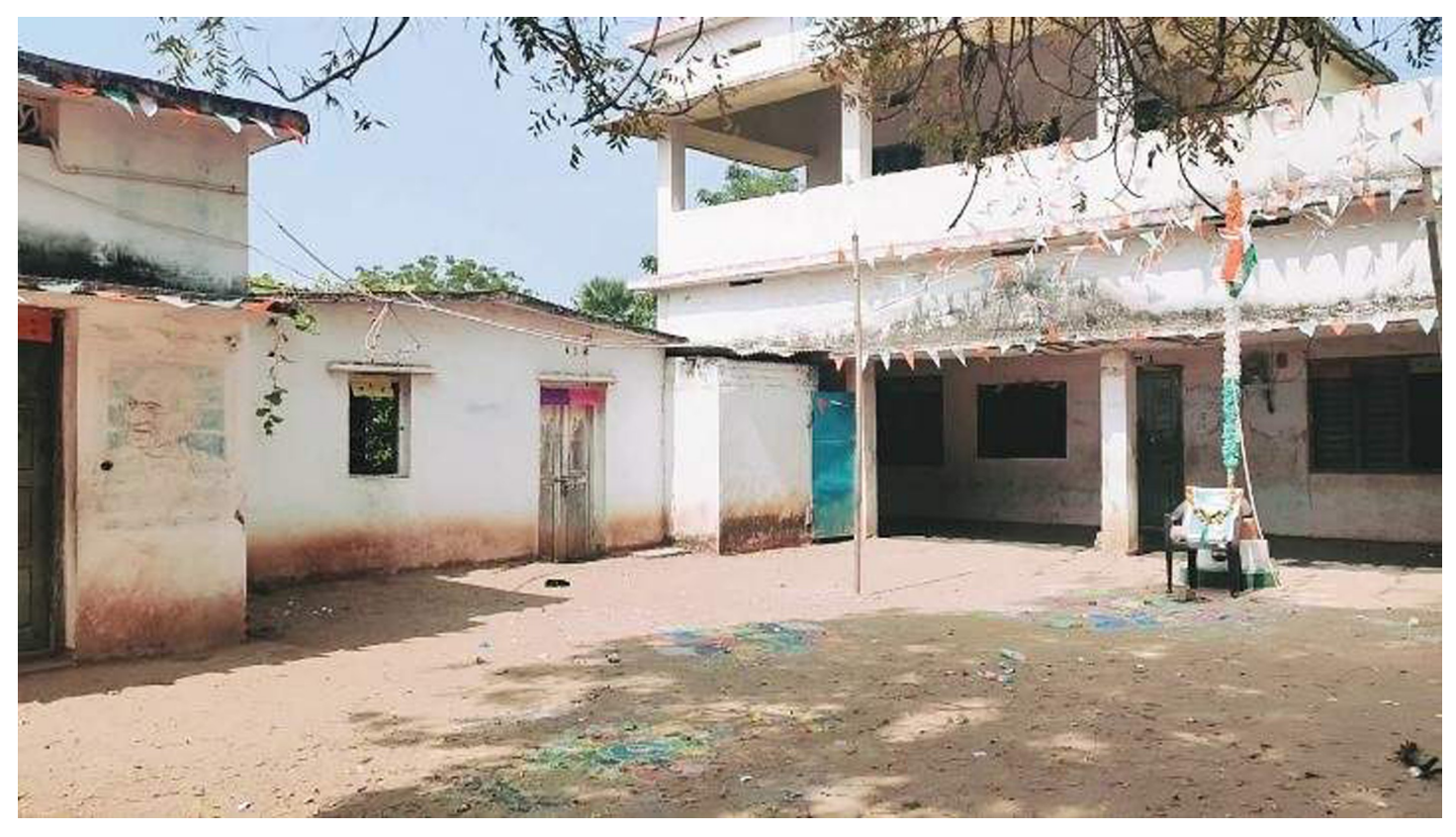
Fig 2. Picture of a household in Diourbel site. https://doi.org/10.1371/journal.pgph.0000525.g002

"It's a house in a barrack, a bedroom, a kitchen and a veranda, the wall is wooden and the floor is cement, a large hall where the Talibés (sand) study and sleep. The entire roof is in Zinc, the windows and doors are also in Zinc. » Wife of a Dahra official.