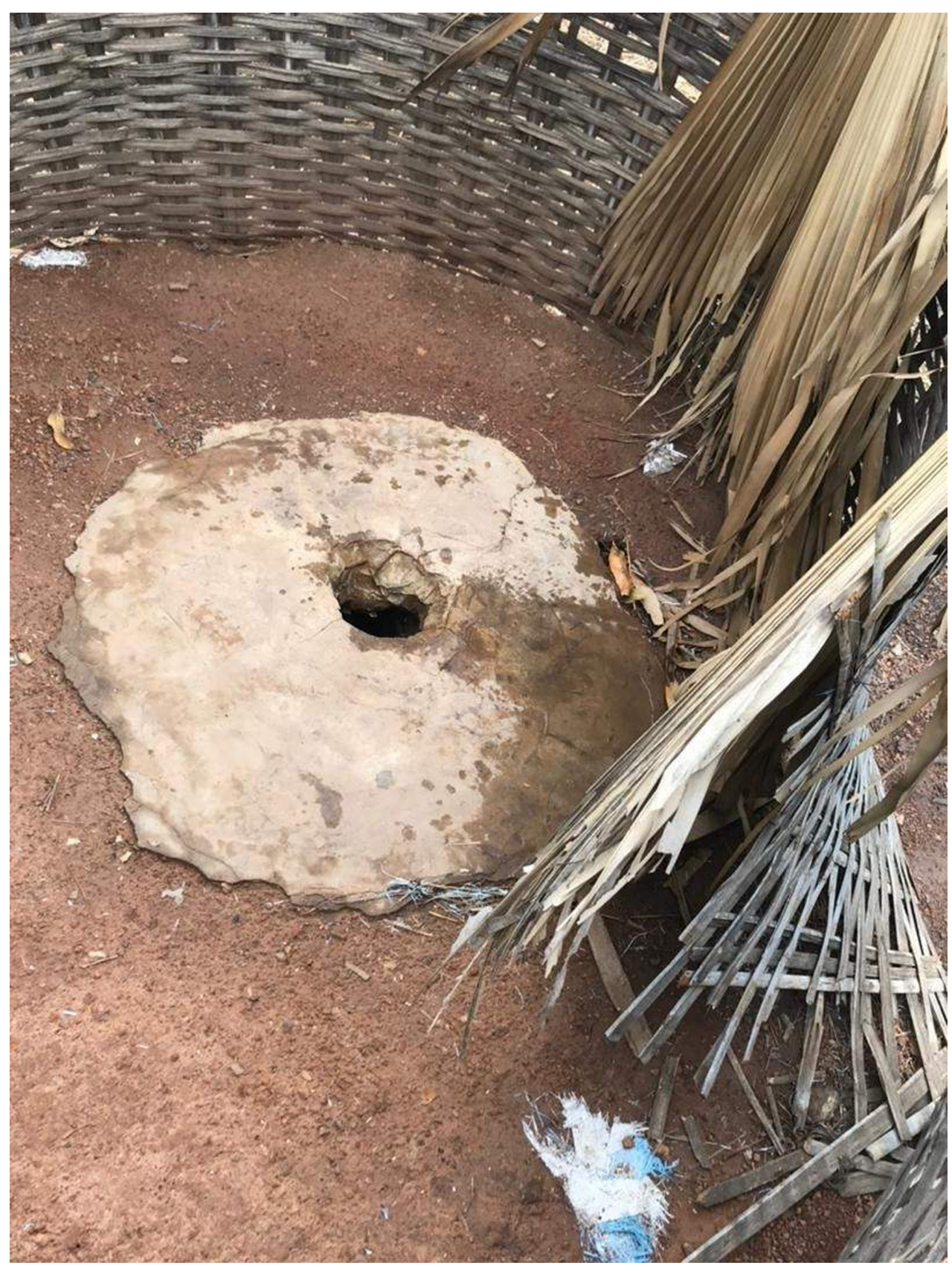
Fig 5. Picture of a toilet facility in Saraya site. https://doi.org/10.1371/journal.pgph.0000525.g005