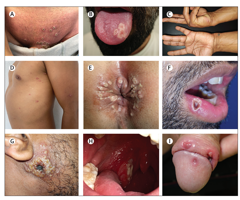
Figure 1: Clinical presentation of monkeypox