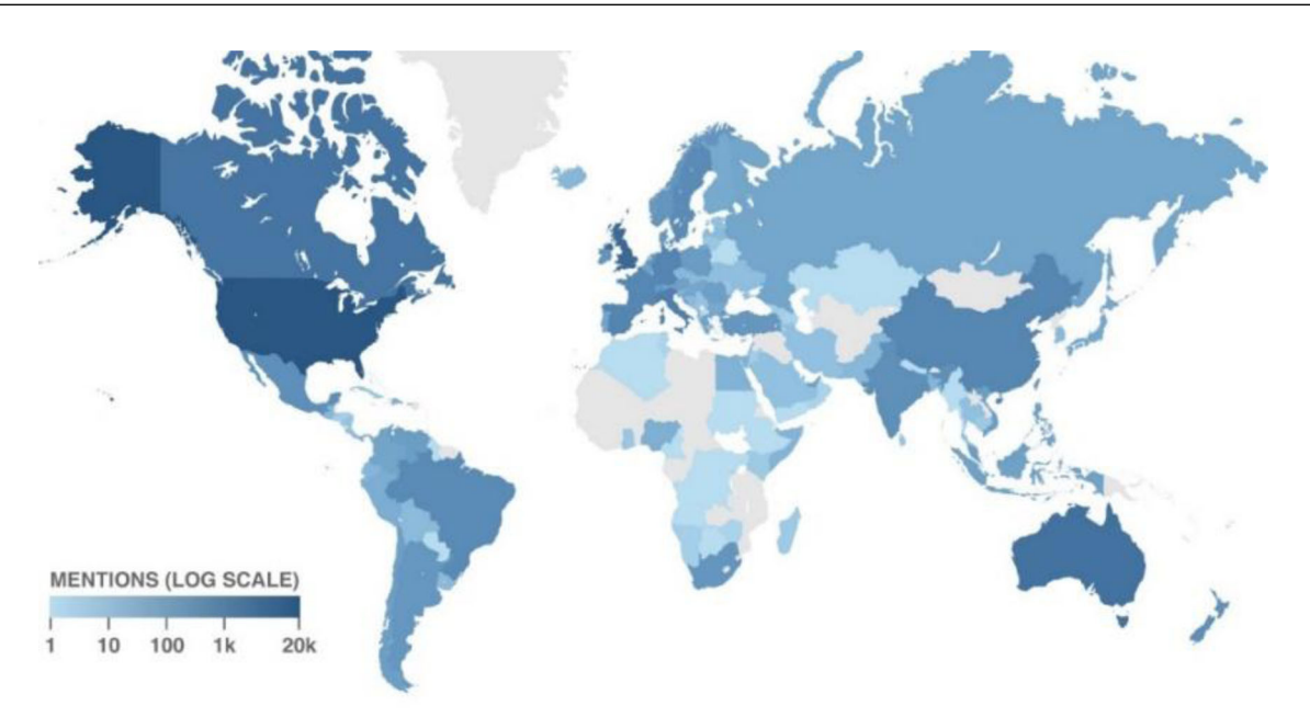
FIGURE 2 Number and reach of on-line news articles between 2016–2017 mentioning Andrew Wakefield's, 1998 research published in the United Kingdom

than for other childhood and adolescent vaccines and significantly lower for boys than girls. Improved vaccination rates, if obtainable, could lead to substantial numbers of lives saved as well as reduced rates of illness (Simms et al., 2020).