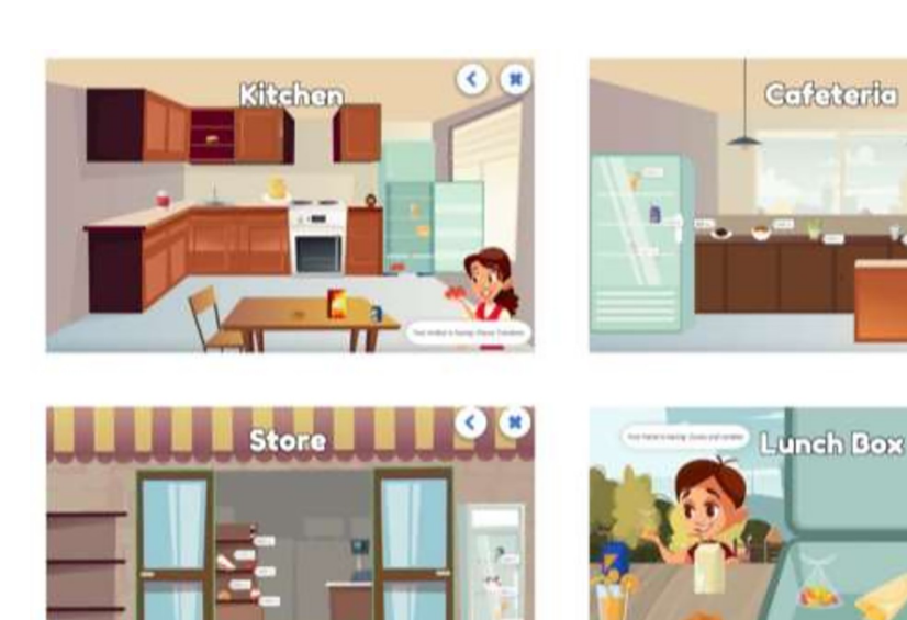
Fig 2. Examples of different scenarios and choice tasks from the choice experiment.

https://doi.org/10.1371/journal.pone.0264963.g002