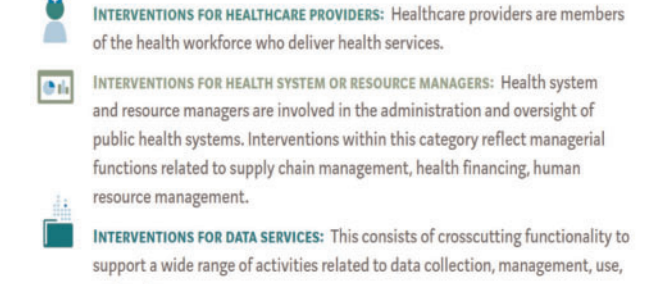
Figure 2 WHO classification digital health services.

Caregivers of clients receiving health services are also included in this group.