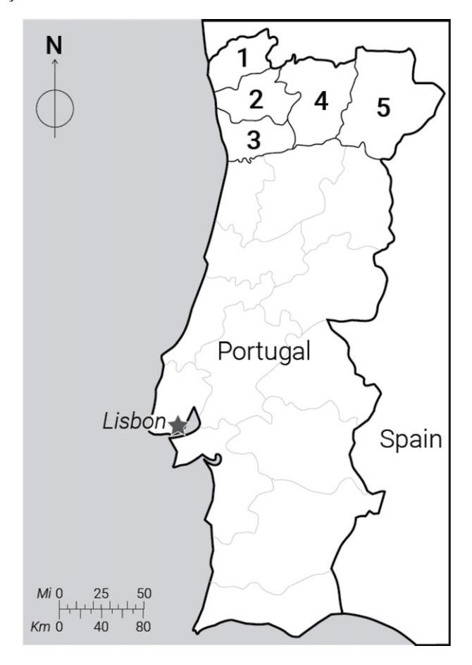
Figure 1. Map of Portugal showing the five northern districts included in this report: 1 = Viana do Castelo, 2 = Braga, 3 = Porto, 4 = Vila Real, 5 = Bragança.

also sometimes possible to identify the likely origin of the infection (autochthonous or imported), the clinical classification (Ridley-Jopling and/or WHO pauci/multibacillary), the existence of disabilities, treatment, etc. The AWI was also valuable as a check and to complete information from the notification forms. AWI was available for all cases notified since 2006.