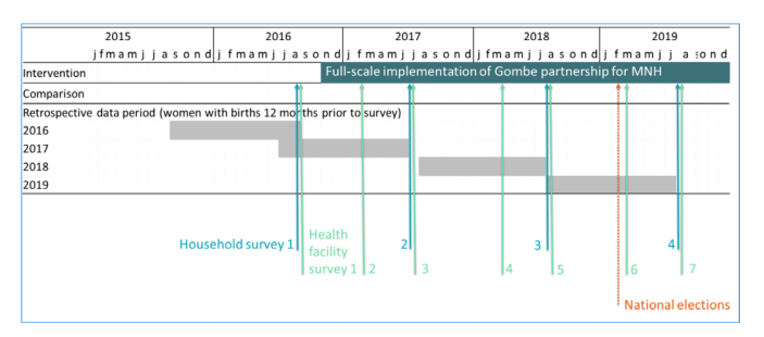
Figure 2 Study timeline. MNH, maternal and newborn health.

During the same period, we conducted seven facility and birth attendant surveys at six monthly intervals. Four surveys were done concurrently with the household surveys