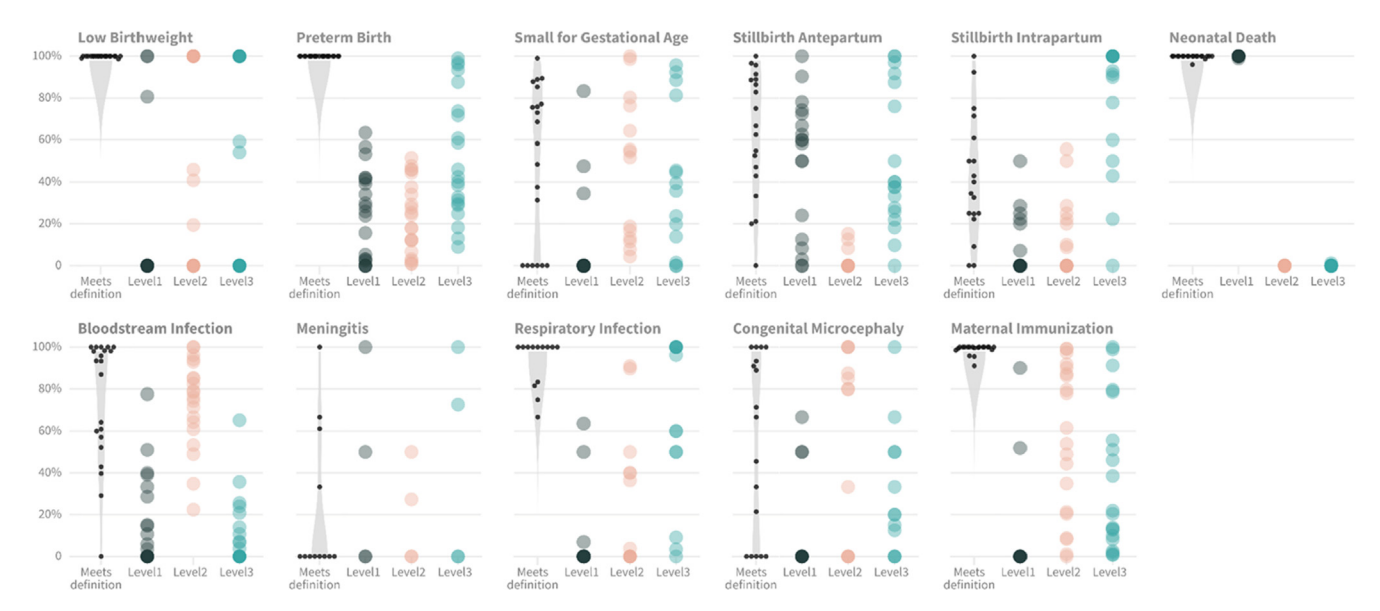
Fig. 1. Applicability of GAIA definitions at the study sites. Study sites are represented by dots (column 1) and circles (columns 2–4). Column 1 ('meets definition') shows, for each outcome, the distribution of the percentage of recruited cases (or, for maternal immunization, identified exposures) that met the GAIA definition across the sites. Columns 2–4 show the distribution of the percentage of cases classified at level 1 (most specific), 2, and 3 (least specific), among cases that met the GAIA definition across the sites. For each individual site, columns 2–4 sum to 100%. The darker the circle, the larger the number of sites.

sites, all the cases within one site were classified to a single level of diagnostic certainty due to the standard operating procedures for birthweight measurements at the sites.