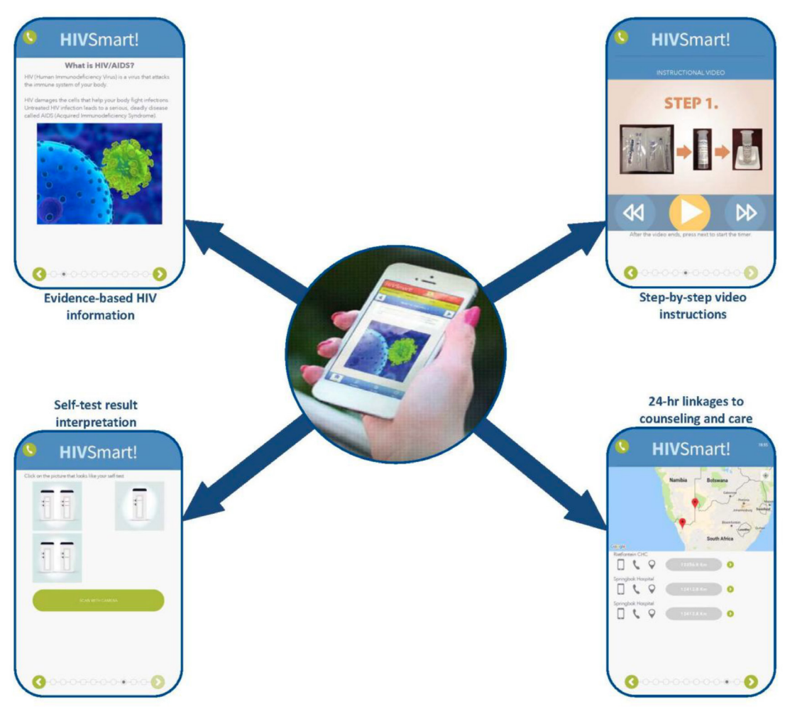
Figure 1 The HIVSmart! app-based digital program of care operated by healthcare workers and peer counsellors in Cape Town, South Africa.

that offered pretest/post-test counselling/linkage service to treatment and prevention pathways, in their preferred language, to nearby clinics. The counselling and linkage service was offered 24/7 by trained healthcare workers and peer counsellors (ie, over phone calls, texts, chats, messages and face to face). We housed our program on a secure Health Insurance Portability and Accountability Act (HIPAA)-compliant cloud server and added a user-friendly dashboard and a global positioning system clinic locator, which was useful to both patients and providers.<sup>22 23</sup>