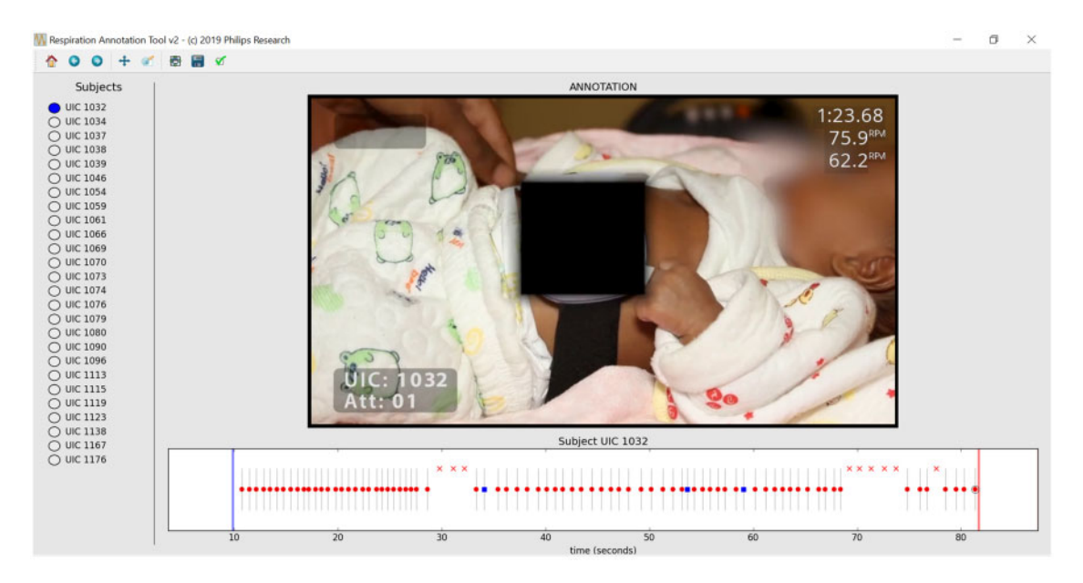
Fig. 1. Timeline of video annotation. Red dots are annotated certain breaths, blue squares are annotated uncertain breaths and red Xs are moments of distortions.

beginning of inhalation to the end of exhalation. As reviewers marked time points of maximum inspiration, in this study, a breath cycle was defined as the time period between two certain breath annotations. The time period between these two points of maximum inspiration included the exhalation and inhalation period hence depicts the time period for a full breath cycle. Fractional breaths at the beginning or end of the calm period were included as proportions of a breath cycle. For all reviewers, the exact same time period was considered to obtain calm periods. See Fig. 2 for a schematic annotation pattern. The Python code for RR computation is referenced under 'Availability of data and materials'. Fast breathing classification was determined by age-based cut-offs according to IMCI guidelines [2]. Time taken was defined as the period during which a reviewer watched and annotated a video. Breaks between review cycles were not included.