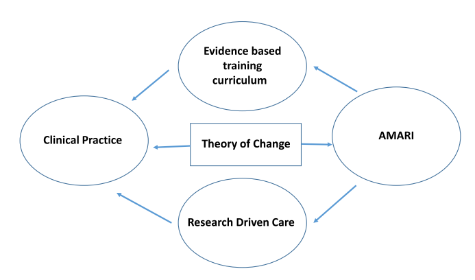
Fig. 2. AMARI future role.

fellows and registration at the institutional level has at times been delayed due to institutionally based administrative barriers such as lack of a post-doctoral career pathway and prolonged ethics approval. Operationalizing some of the AMARI developed online systems such as the Monitoring and Evaluation online log book, running the Webinar Series has been challenging due to unreliable and poor internet connectivity in some AMARI institutions. Finally, the proportion of clinicians applying for the program has been low with only six (16%) clinicians applying for either the MPhil, Ph.D. or post-doctoral positions. There is therefore a need to look into ways of making research a critical component of clinical work in SSA (Abas et al. , 2014) by focusing on research that can be translated into clinical practice and contribute toward narrowing the treatment gap for MNS.