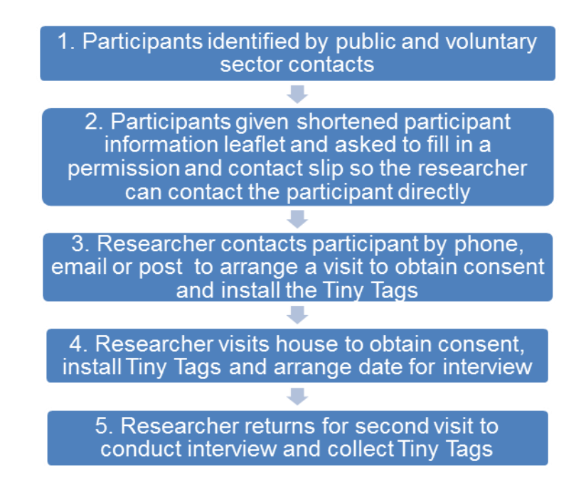
Figure 1. The research process for the Warm Well Families project (project 3)

There was a common method throughout the studies whereby data loggers recorded room temperature and relative humidity over regular intervals for a period of up to two weeks. An indepth interview was conducted, usually at the end of the temperature and humidity measurement period to understand the heating behaviours and challenges over the monitoring period. An example of the process is provided in Fig 1 below, taken from the Warm Well Families project<sup>33</sup> (project 3 above) The data logger device used in this study was a Gemini Tiny Tag2.