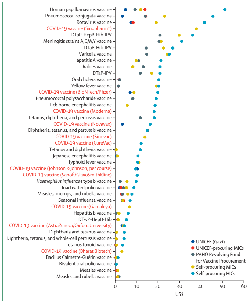
Figure 3: Median price per dose for existing vaccines and for leading COVID-19 vaccine candidates by procurement or country income group

Major donors and lenders, such as the World Bank and other multilateral development banks, have earmarked billions of dollars in funds for COVID-19 vaccination programmes in low-income and middleincome countries.<sup>29,30</sup> These funds can be used to buy vaccines that have been authorised by stringent regulatory bodies or WHO. The G20 group of highincome countries' Debt Service Suspension Initiative might provide additional fiscal space too, by allowing the world's poorest countries to spread repayment of debt owed to other countries over extended periods. Although this initiative does not address debt owed to private creditors, the hope is that the temporary suspension of some repayments could release resources for more countries to better meet the costs of obtaining and administering vaccines.31