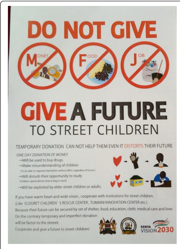
Fig. 2 County policy document on SCY

professionally trained teachers, but if you do something nasty, they will remind you that you were a street child. (Stakeholder)