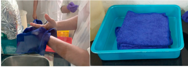
FIGURE 1. Pictures of the Supertowel being used as part of the laboratory experiments. This figure appears in color at www.ajtmh.org .

between the fingers, fingertips, and over the back of the hands (60 seconds in total).