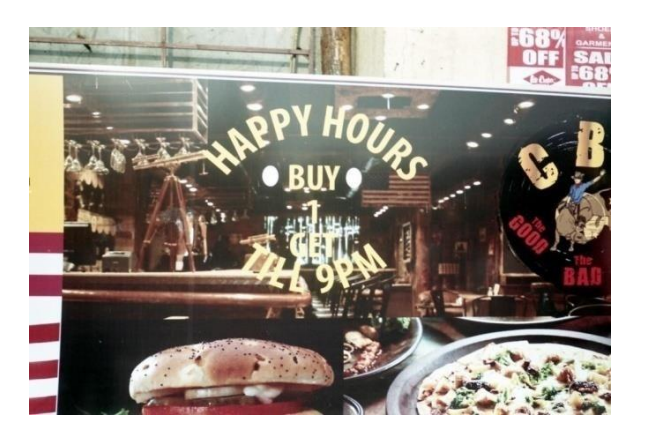
Figure 4. Alcohol Promotions. In this image captured by a photo voice male participant, the person is capturing an image of an alcohol promotion that is offering buy one drink and get one free as a deal with a meal in a restaurant that looks fancy and a place students will visit for food and fun Caption by the participant: Happines.

over here and even if you manage to get it (alcohol bottle) I had experience where they began saying enjoy it baby and things like that." (young female,24). Consequently, female