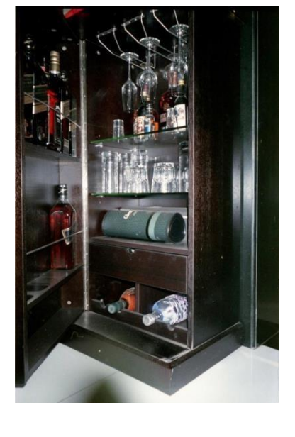
Figure 1. Liquor Cabinet at home. This picture was taken by a female participant of a liquor cabinet in her house to show how the presence of alcohol within the home reduces the taboo of drinking alcohol and can make access to alcohol easy with parental consent. Caption by the participant: The Home is where the heart is.

The GPS location data were downloaded and GIS analyses conducted, including proximity/accessibility analysis, preparation of maps and exploratory data analyses, using Quantum GIS (QGIS) and R statistical software [12]. For accessibility analysis, three circular buffer zones were created around the institutions with varying distances (i.e. 100m, 300m and 500m) using Euclidean straight-line distances [13]. GPS coordinates of the venues were securely stored and not made visible on published maps. Photo voice is a participatory action research method that engages participants in documenting their world using photographic images that are interpreted with captions [14,15]. The photographic images are then used in focus group discussions, termed photo-dialogues, to stimulate dialogue on the issue of interest. Participants were recruited using convenience sampling by advertising