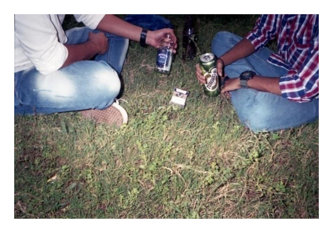
Figure 3. This image was captured by a photo voice male participant to show alcohol as part of socialization with friends and how friends explore various drinks together out of curiosity and helps them have a good time. Caption by the participant: Good friend, good wine, good times.

Participants reported that non-drinkers, are labeled as boring or un cool, and may not be invited to events.