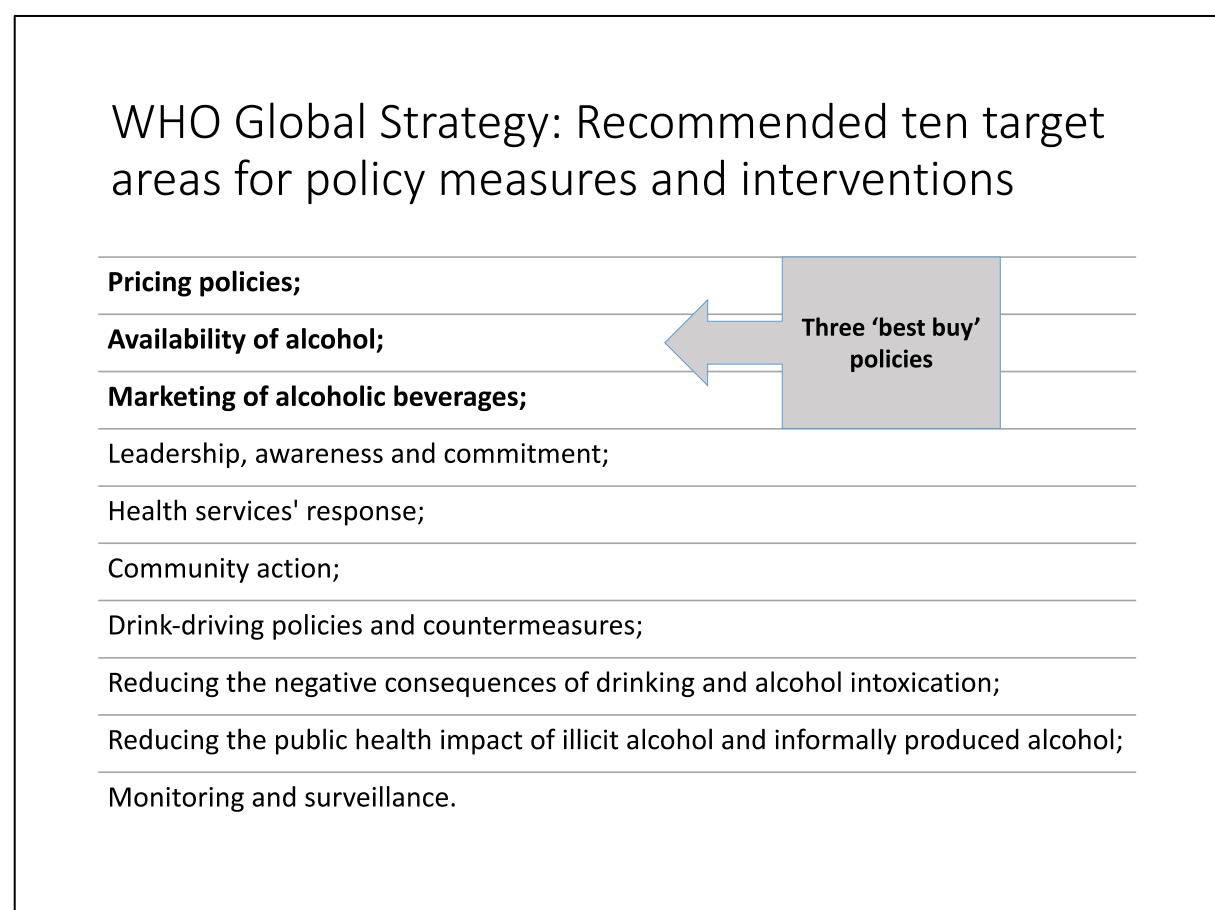
Figure 1: WHO policy recommendations to reduce harmful use of alcohol

that reduced alcohol affordability, availability and promotion. It also found evidence that alcohol industry involvement in policymaking was problematic due to their active opposition to the ‘best buy’ policies identified above. A number of tactics employed by the alcohol industry to influence the policymaking process were described and compared with those used by the tobacco industry. Such tactics were reportedly designed to promote less effective policy solutions with a weak evidence base and obstruct effective solutions, due to an inherent COI between alcohol industry economic objectives and public health goals.[23] The PHE evidence review acknowledged research findings which recommended “policymakers need to be aware of these [strategies] in order to understand how the alcohol industry may try to influence the policymaking process” and “the similarities [between the alcohol industry and tobacco industry] suggest that alcohol policy may benefit from reproducing efforts in tobacco control aimed at excluding corporate actors from the policy process and enhancing transparency”. [23]