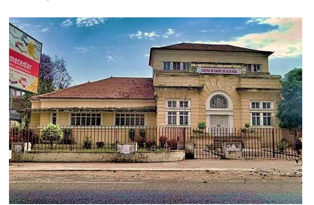
Fig. 1: Study settings and HIV clinics in the 3 sites (from left to right: Homa Bay, Chiradzulu and Maputo)