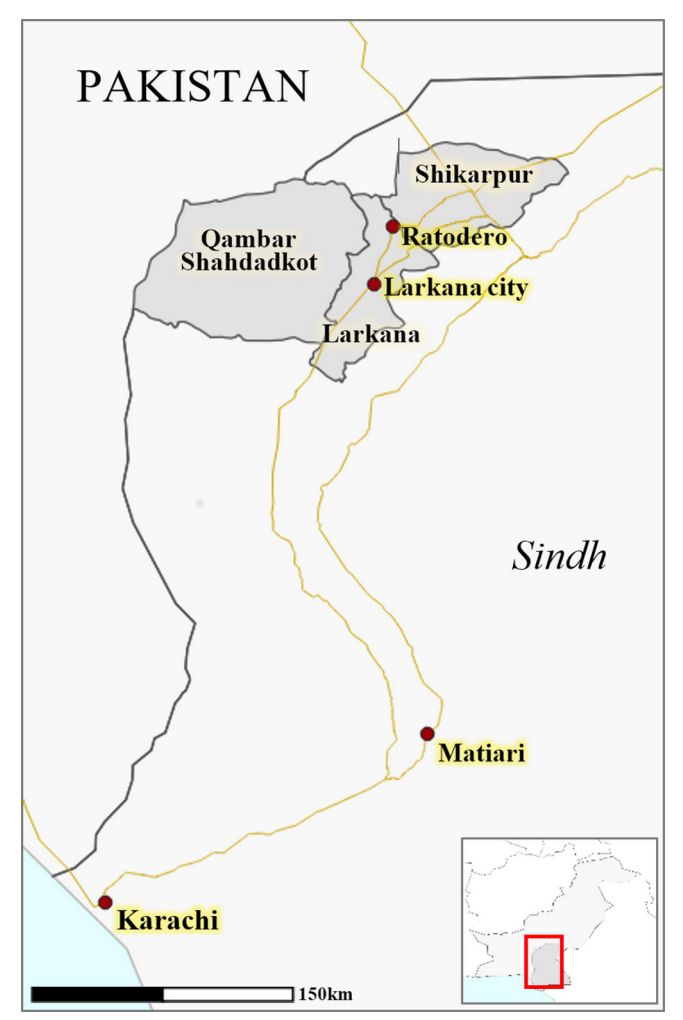
Figure 1 Map of the study sites.

A case will be defined as a child aged below 16 years registered for HIV care at the paediatric HIV treatment centre in Larkana city, regardless of whether she/he is taking antiretroviral therapy (ART). A control matched for sex, age (±1 year) and neighbourhood will be defined as an individual who tests HIV negative. Exclusion criteria will