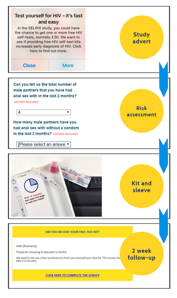
Figure 2. Intervention A.

The logic model articulates intermediate outcomes assumed to be precursors to achieving the trial outcomes. Each intermediate outcome relates to a documented deficit or need constraining testing within the target population and which intervention design has identified as a key area which requires change. They are described as an outcome (e.g. increased risk perception) and a COM-B-linked domain which required alteration to achieve this. None of the intermediate outcomes were related to capability concerns as a barrier to uptake as these had already been mitigated via the provision of enhanced support and through intervention messaging [14].