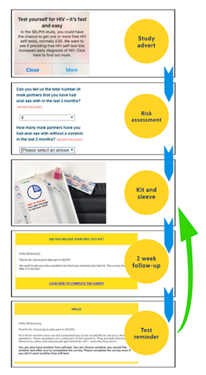
Figure 3. Intervention B.

Understanding differences in experience in groups of individuals has long been a public health aspiration. Latent class analysis is a method often used in quantitative studies which seeks to create groups based on shared demographic and behavioural traits and uses these to investigate differences in outcomes [31,32]. We draw on the foundational principles of this approach and apply them to a qualitative analysis to examine how different groups of participants understand the utility of HIVST in the context of their testing behaviour. These findings can be used to guide commissioners and health promoters in how HIVST interventions might be adapted to better meet a range of needs and improve outcomes.