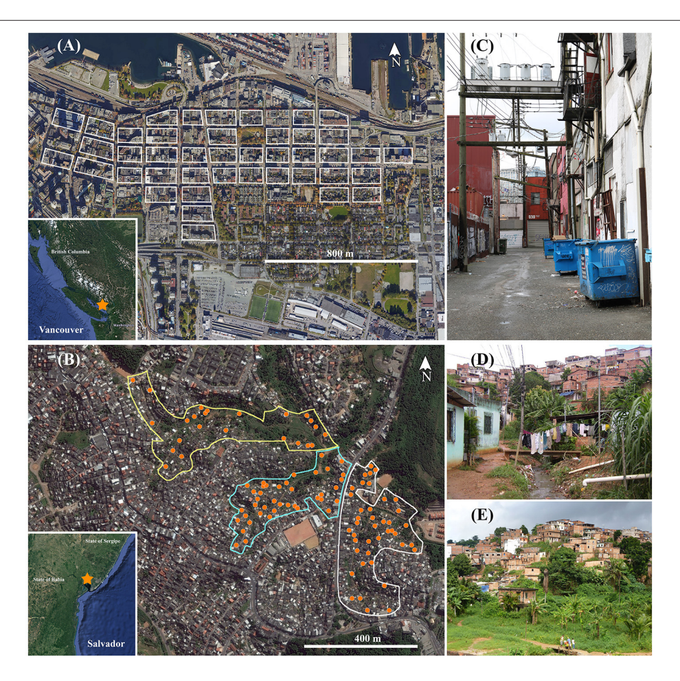
FIGURE 1 | Trapping locations in the 43 city blocks of Vancouver, Canada (A) and three valleys of Salvador, Brazil (B). Images provided through Google Earth Professional (https://www.google.com/earth/download/gep/agree.html). Examples of areas where rats were caught in each location are indicated in (C) (Vancouver), (D,E) (Salvador).

Three trapping sites were selected within each sampling point based on signs of rat presence, and two Tomahawk traps were placed at each sampling point. Trapping occurred during four periods of time (May–August 2013, October–December 2013, March–August 2014, September–December 2014). Traps were pre-baited for 2 to 3 days, followed by 4 to 6 consecutive days of active trapping. Traps were baited with sausage. Traps were set at sundown and trapped rats were collected at sunrise the following day.