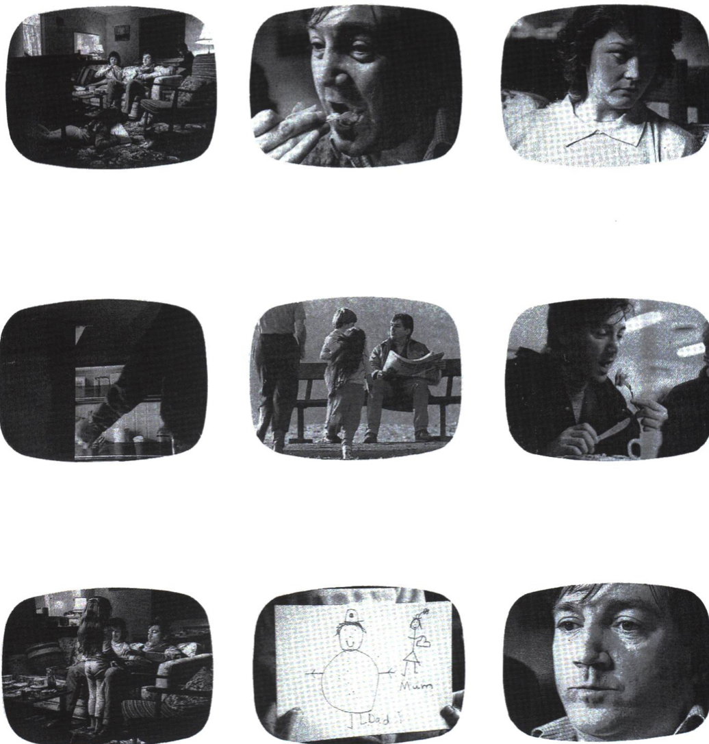
Figure 3: Stills from “Stop” television advertisement, 1988 97

The advert was initially screened over the New Year period between 1988 and 1989, which was thought good timing, and not just for the festive season’s apparently favourable advertising rates: ‘a very appropriate time to advertise,