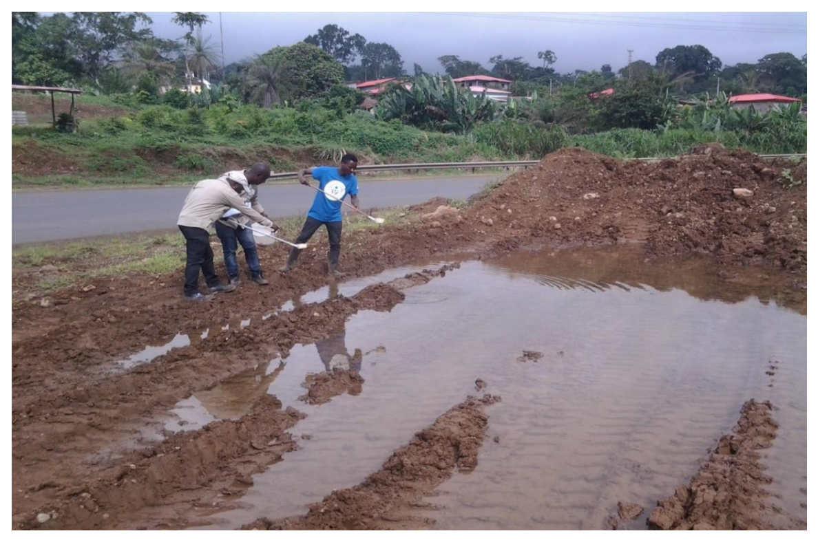
Fig. 4. Vehicle ruts with clean water that provides breeding sites for Anopheles larvae.

Fig. 3. Residual effectiveness of ACTELLIC 300cs organophosphate against mosquitoes from urban Malabo, Bioko Island.