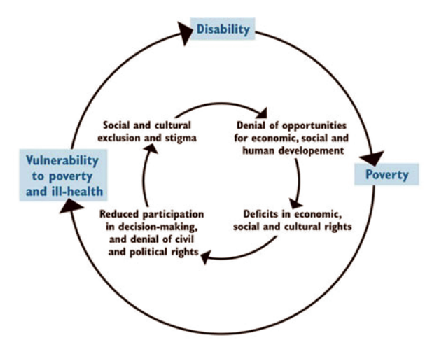
Figure 2: Disability-Poverty Cycle

Disability is linked to poverty through influences such as poor access to services (e.g., medical care and rehabilitation), unhealthy living conditions, limited access to education and employment, and social exclusion (World Health Organization and World Bank, 2011). This study reveals that people with disabilities in Uttarakhand face barriers and have poor access in all these areas.