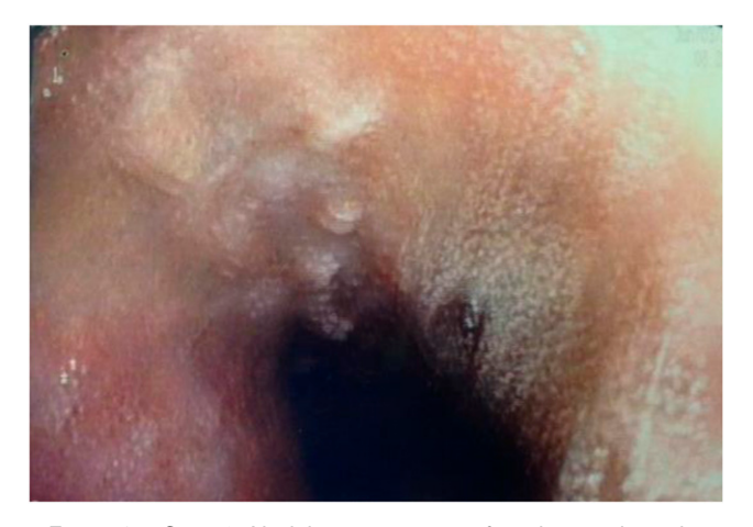
FIGURE 1. Case 2. Nodular appearance of trachea on bronchoscopy, due to mucosal leishmaniasis. This figure appears in color at www.ajtmh.org.

Case 5. A 54-year-old woman was referred in February 2016 with a 3-month history of a hoarse voice, cough, and choking episodes. She had a history of a previous crusted ulcer on her leg, which spontaneously healed 8 years prior to presentation. She had lived for periods in a rural area of Greece for the previous 11 years. She has had a past medical history of emphysema for 15 years for which she had received numerous courses of mainly inhaled but also systemic corticosteroids.