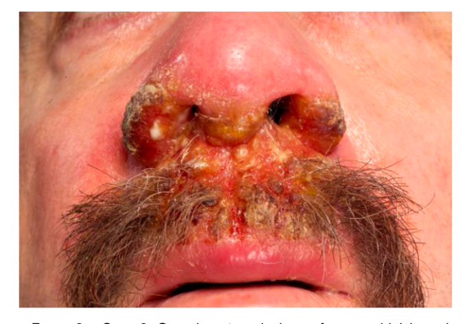
FIGURE 2. Case 3. Granulomatous lesions of mucosal leishmaniasis of nasal passages and surrounding skin. This figure appears in color at www.ajtmh.org.

Case 4. A 60-yearold woman was referred in May 2015 with a 4 month history of a hoarse voice and occasional fever. She recalled a previous skin lesion affecting the neck which had spontaneously healed which may have been localized CL. She had lived in southern Spain for the past 7 years. She had a 10-year history of asthma, for which she