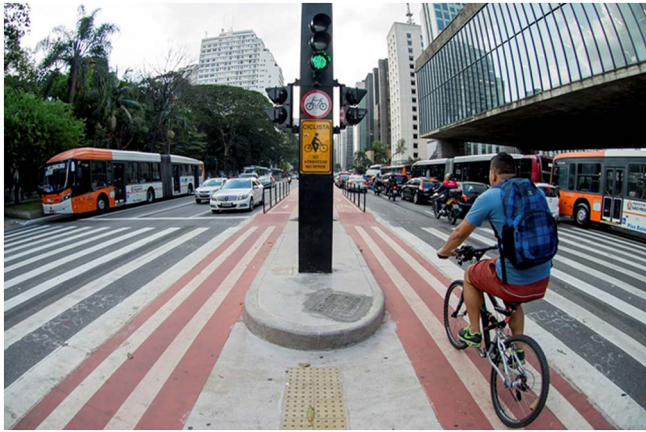
Fig. 3. Cycle lane at the Paulista Avenue, São Paulo, built in 2015. Note motorcycle trafficking between car queues, a common feature in São Paulo, and the dedicated bus lanes next to the sidewalks. Left, the remaining original vegetation that once were in the Paulista Avenue (Trianon Park); Right, the Museum of Arts of São Paulo (MASP).

outcome associations were not included, such as vehicle speeds, which could affect air pollution due to an association between speed and congestion as well as the number and severity of traffic injuries (Elvik, 2013); traffic noise; and other forms of interpersonal violence related to travel behaviour (e.g., female sexual harassment and road rage episodes). We also did not model changes in vehicle emission factors, particularly cleaner buses for public transport, which if implemented would produce substantial health benefits.