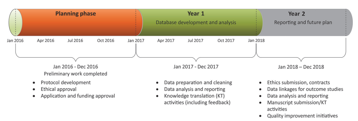
Figure 3 Project timeline/milestones.

ACEi, ACE inhibitor; ACR, albumin to creatinine ratio; ARB, angiotensin-receptor blocker; BP, blood pressure; CKD, chronic kidney disease; CVD, cardiovascular disease; eGFR, estimated glomerular filtration rate; EPI, Epidemiology Collaboration; HbA1c, glycated haemoglobin concentration; KDIGO, Kidney Disease Improving Global Outcomes; Scr, serum creatinine.