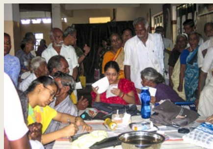
Time management is important when the clinic is very busy. INDIA