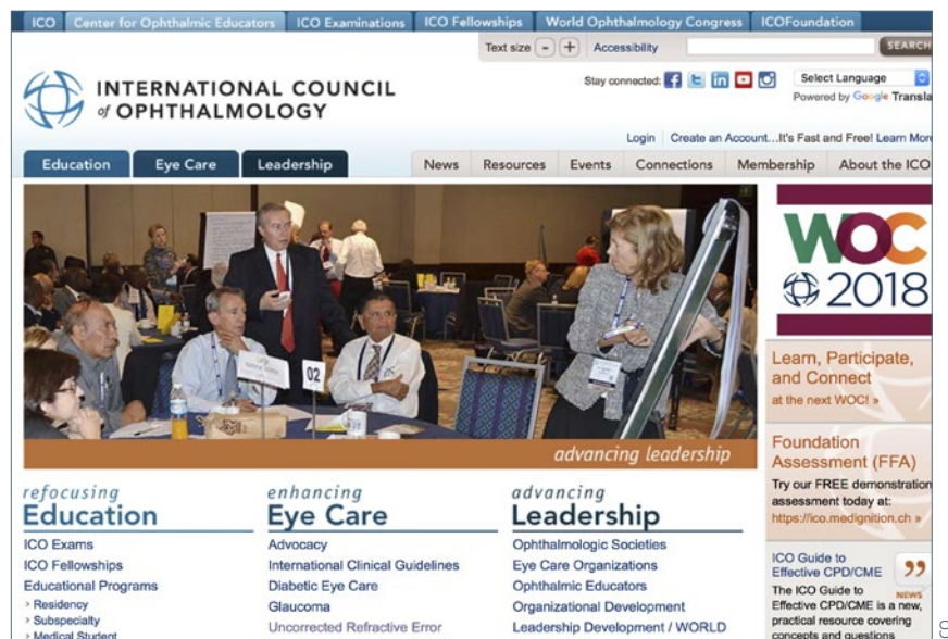
ICO website (screen grab) – an established resource for CPD.