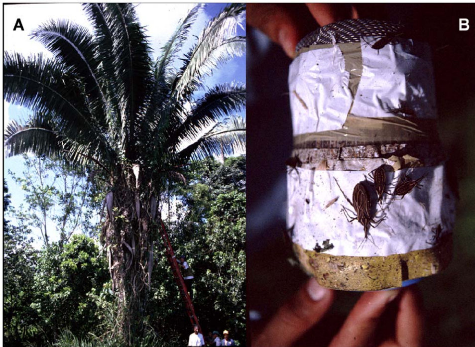
Figure 2. Sampling Rhodnius spp. in Attalea palm trees. A: a ladder is used to climb an Attalea butyracea palm to remove traps and manually search for bugs. B: a mouse-baited adhesive trap with several Rhodnius specimens adhered to the tape. doi:10.1371/journal.pntd.0000620.g002