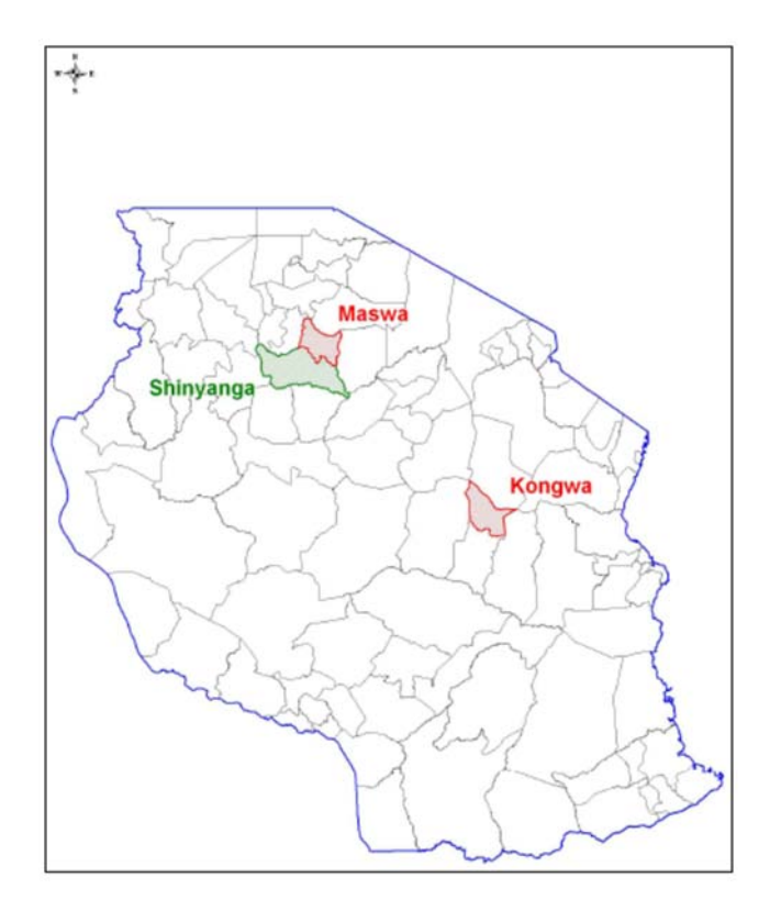
Figure 1. Location of project districts by role in study. The red areas denote the two intervention districts, while the green area shows the control district. doi:10.1371/journal.pone.0006857.g001

The intervention was conducted in two rural districts of Tanzania: Maswa in Shinyanga region and Kongwa in Dodoma region. A third district, Shinyanga Rural in Shinyanga region, served as a control (see Figure 1). We conducted a detailed analysis of all districts in the country according to a range of key indicators, including malaria endemicity, population per health facility, employment, prevalence of private drug shops, and bed net ownership. The selected districts were among the few roughly comparable across all indicators, with high malaria transmission, large numbers of private drug shops and, importantly, no malaria-related trials (e.g., vaccines) underway. Socioeconomic status in the three districts was below national averages as evidenced by comparison of key assets such as housing materials, toilet facilities, and availability of electricity [12]. The selected districts were