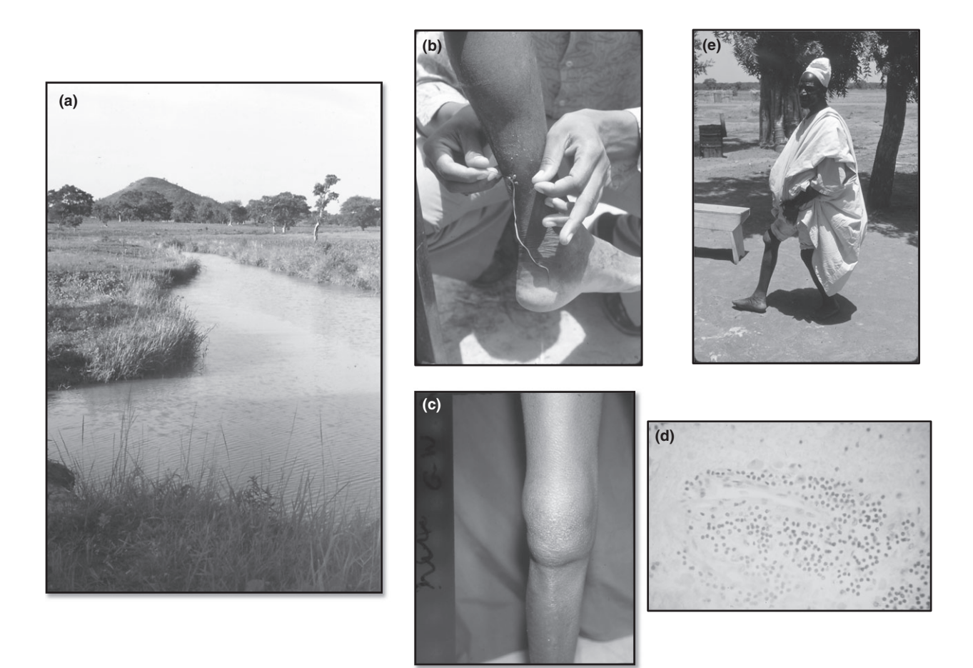
Figure 2 (a) Typical pool used for washing and as a source of drinking water during the farming season, (b) local extraction of a guinea worm using a twig, (c) arthritis of the knee in a patient with a guinea worm emerging above the medial malleolus, (d) synovial needle biopsy from the patient shown in panel c showing infiltration of the synovium with mononuclear cells, (e) long-standing damage to the knee and permanent disability following guinea worm arthritis of the knee.

anaerobically for 48 h. The predominant colony was characterised by morphology and by Gram stain and the species identified using conventional microbiological techniques. Antibiotic sensitivity against penicillin, streptomycin, chloramphenicol, tetracycline and neomycin was determined using a disc method.