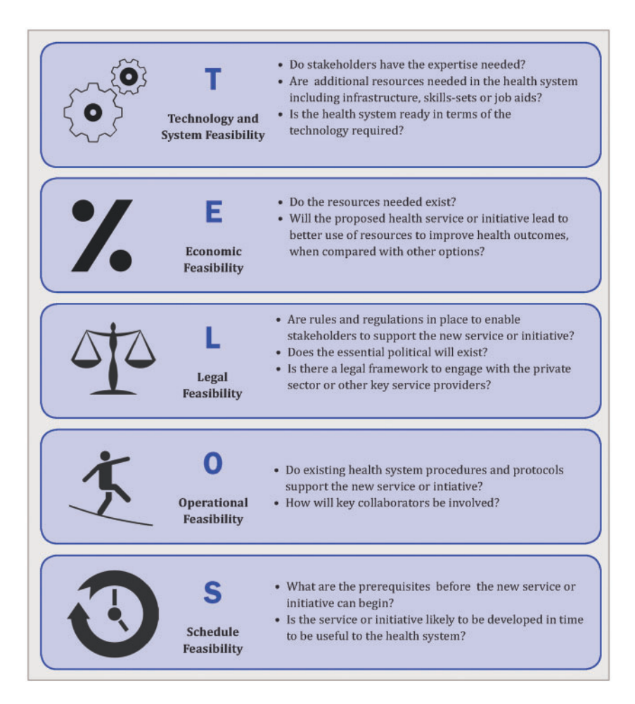
Figure 2. TELOS framework: guide questions for feasibility research

mention that these terms do not represent equivalence in terms of population size: for example, a block in India may have a larger population than a woreda in Ethiopia.