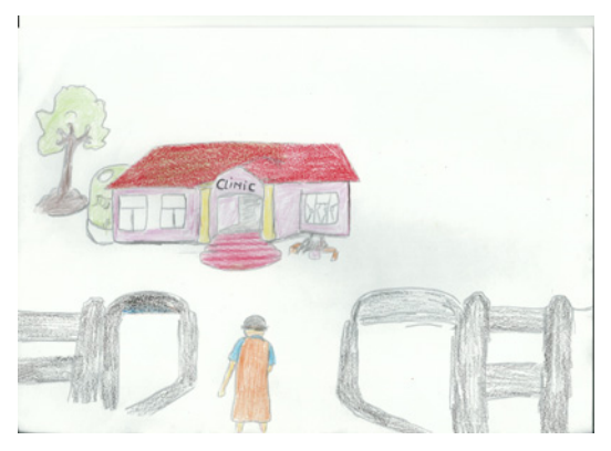
Fig 3. Participant drawing depicting walking to clinic to do an HIV test.