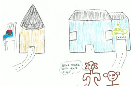
Fig 4. Participant drawing depicting the isolation of HIV stigma.

One story also revealed the violence that a woman encountered when she disclosed to her partner and others described how stigma could lead to secrecy, which can have a negative