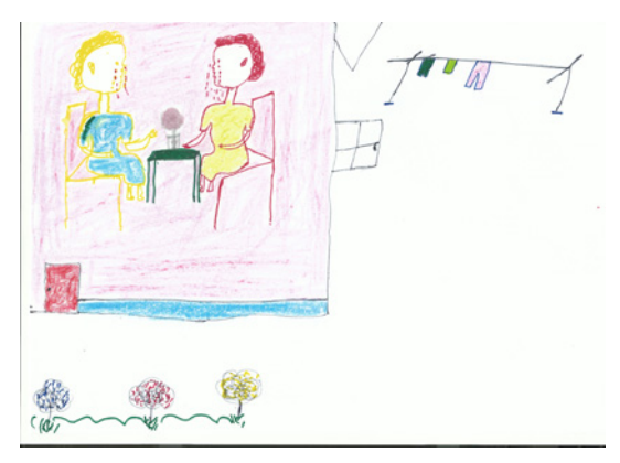
Fig 5. Participant drawing depicting the pain of disclosure.