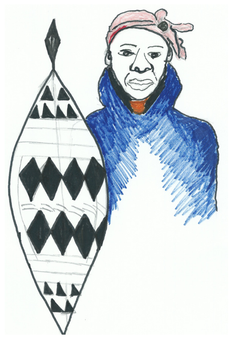
Fig 1. Participant drawing depicting the 'armour' of ART.