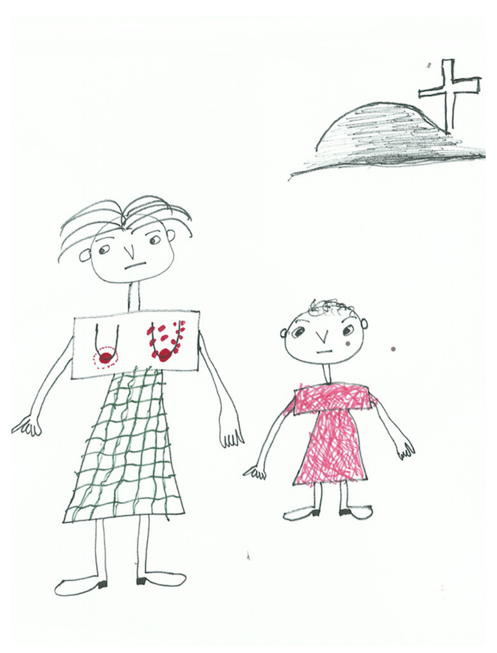
Fig 2. Participant drawing depicting the loss of a child.