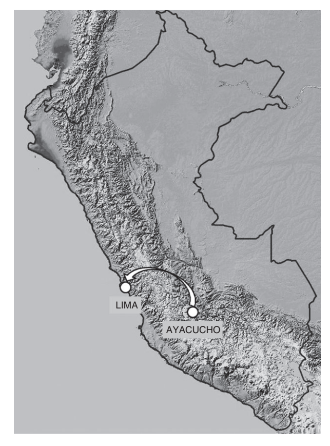
Figure 1 Peru map showing the locations of Secce (Ayacucho) and Lima (modified from reference 11).

Pampas de San Juan de Miraflores was the urban area for the study. It is a typical shanty town where migrants from rural areas have moved into Lima, Peru's capital,