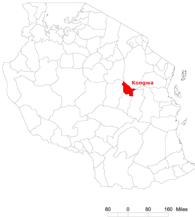
Figure 2. Location of Kongwa district in Tanzania. doi:10.1371/journal.pntd.0000861.g002

Gambia a census was made of the de facto population (those who had slept in the household the night before) within the week before examination to limit absenteeism. In Tanzania the census included all persons resident in the village for at least three months unless newly arrived or newborn. In both countries, the census served as the basis for making a random selection of 100 sentinel children aged 0–5 years in each community for examination.