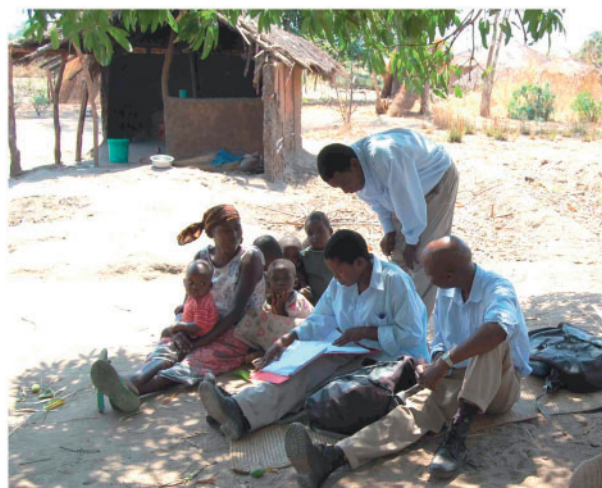
Photograph 1 Karonga HDSS—survey team recruiting family for survey (written consent obtained from participants).

Research plans for the near future include an expansion into the area of non-communicable diseases, particularly diabetes and hypertension (which account in part for an increasingly high burden of disease in this setting), an increased emphasis on intervention studies and establishment of an urban partner site in Lilongwe.