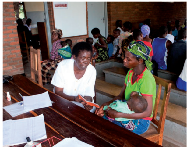
Photograph 2 Karonga HDSS—nurse recruiting mother and child for paediatric disease surveillance in health facility (written consent obtained from participants).

At the end of 2011, 35 730 individuals from 8285 households were under observation in the Karonga