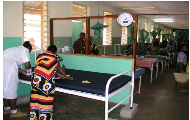
Fig. 1. The paediatric assessment unit with the ward in the background.

Inside the ward, we sectioned off one end with a wooden partition. On one side of the partition we had two