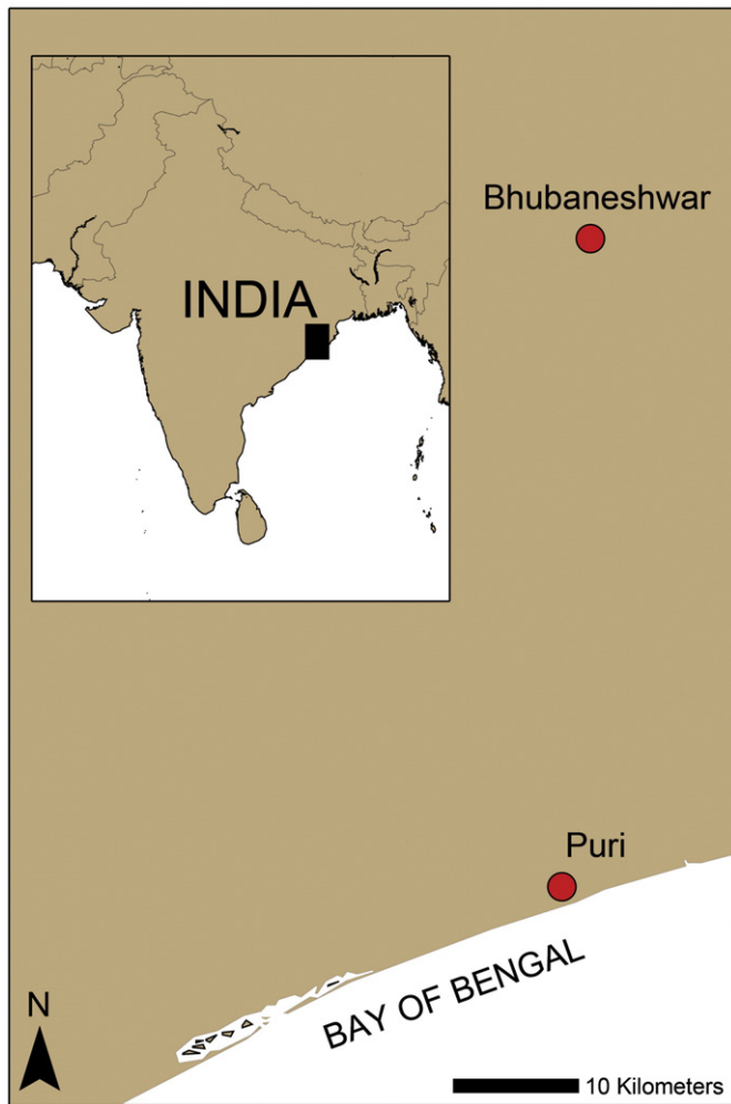
Fig. 1. Overview map of the study area in Odisha, India, where fecal samples were collected for comparative testing of different Bacteroidales assays.

the performance of 41 assays against 64 blind fecal samples in 27 laboratories. Drawing on this comprehensive evaluation, we identified the remaining candidate human- (HF183 Taqman, BacHum, HumM2 and BacH), ruminant- (BacCow), cattle- (CowM2) and dog- (BacCan) associated assays. Note that BacCow was reclassified as a ruminant-associated assay (Raith et al., 2013). For the two candidate universal/general Bacteroidales assays, we compared BacUni and GenBac3. BacUni has been reported to perform well not only in the US but also in a developing country, Kenya, where people have a very different diet from the US (Kildare et al., 2007; Jenkins et al., 2009; Silkie and Nelson, 2009). GenBac3 markers were reported to be abundant in human sources and 20 representative animal sources collected across the US, using a large number of test samples ( n = 223 ) (Kelty et al., 2012).